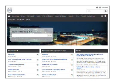
Volvo Car Sweden's knowledge base, ComAround Knowledge™