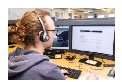
A Customer Care Agent at Volvo Car Sweden

The Customer Care Center also wanted the supplier to be a specialist in Knowledge Management that was agile and innovative and equally curious about developing itself. This was important because they intended to work together with the supplier for many years to continue to develop the customer journey and the Customer Care Center.